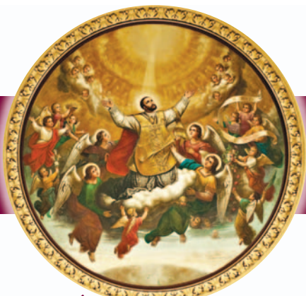
A Jesuit Apostolate